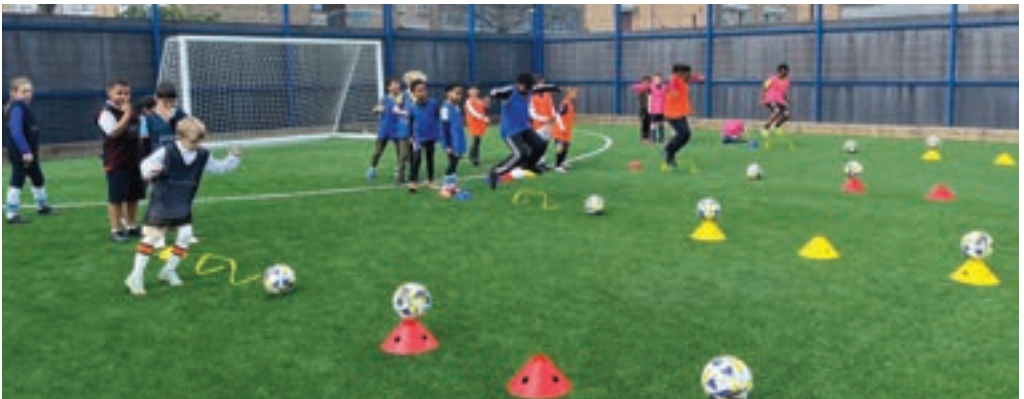
Football Fun Day, Junior Easter Holiday Scheme, April 2023