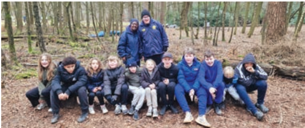
Hindleap Warren, January 2023