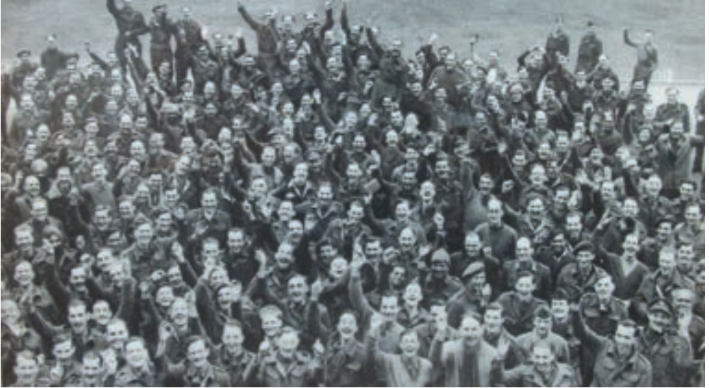
Liberation Day – 12th April 1945