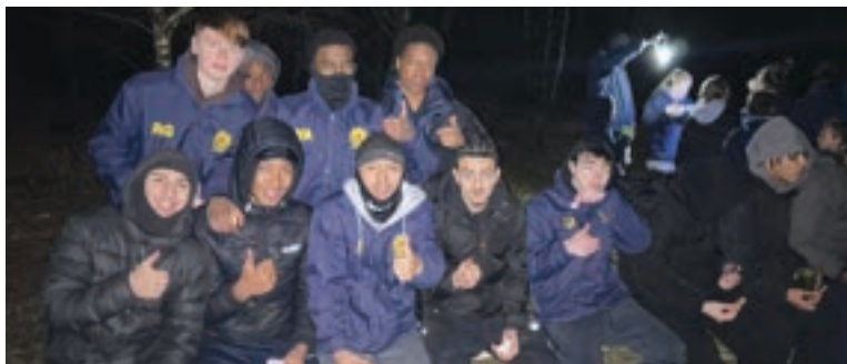
Hindleap Warren, January 2023