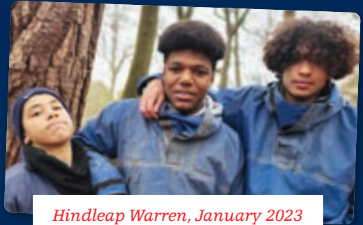
Hindleap Warren, January 2023