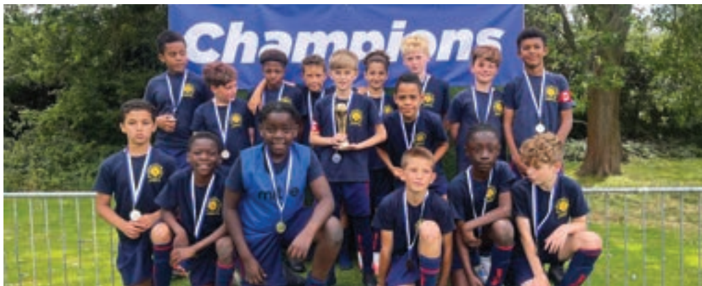
Under 9s at the Brook House Youth FC Tournament, July 2023