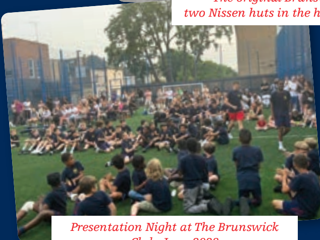
Presentation Night at The Brunswick Club, June 2023