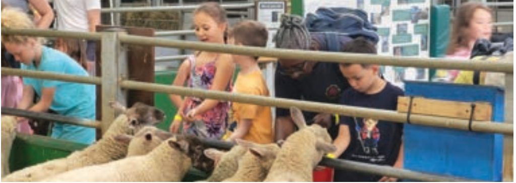
Bocketts Farm, Junior Summer Holiday Scheme, July 2023

Since 1945, the support the Club has received from the founders, their families, past members, and friends, has made it possible for us to provide an excellent range of services and activities for the children and young people of Hammersmith & Fulham and beyond. In the current cost-of-living crisis, our need for financial support is more pressing than ever.