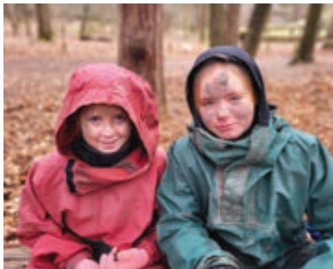
Brunswick 4 Life, Friends For Ever

Begbies 9 Bonhill Street London, EC2A 4DJ