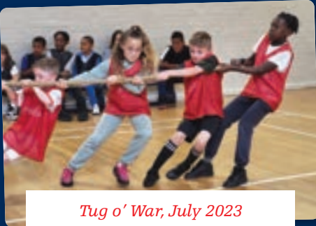
Tug o' War, July 2023