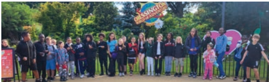
Junior Summer Holiday Scheme, July 2023