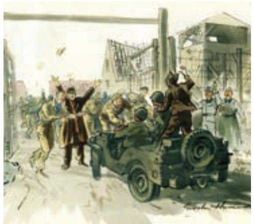
“The US Cavalry” – 12th April 1945