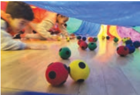
Junior Half Term Holiday Scheme, February 2023

We also played host to Kixstar Dragon Taekwondo, the Fulham Junior Chess Club, Aspire FC, Fulham Lions FC, Tiny Feet Sports, Samba Soccer Schools, and the CDA Fencing Club – all of whom provided regular sessions for children and young people in their respective fields.