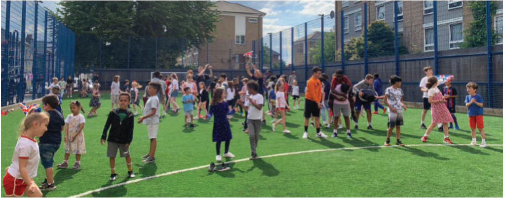
Queen's Platinum Jubilee Party, June 2022