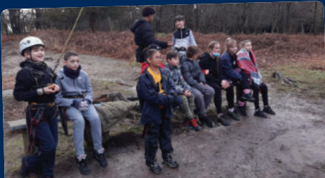
Hindleap Warren, January 2022

"Always do the right thing at the right time and never leave anyone out."