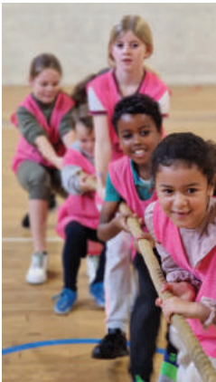
Junior Holiday Scheme