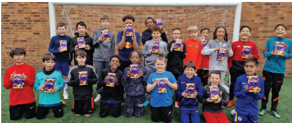
Junior Easter Holiday Scheme, April 2022