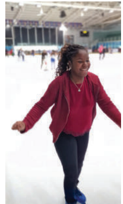
Senior Holiday Scheme