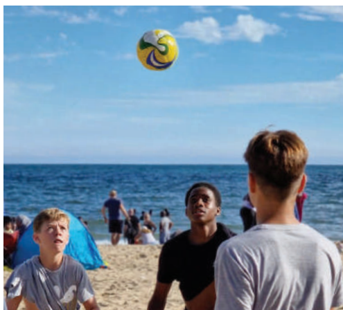
Senior Holiday Scheme, August 2022