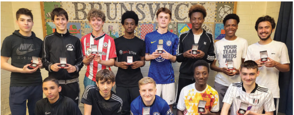
Brunswick Under 16s, June 2022