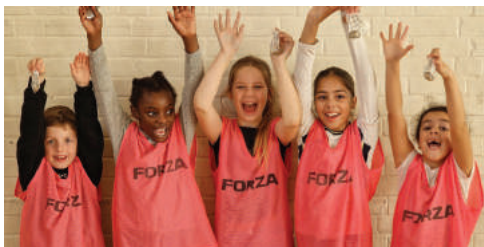
Junior Half Term Holiday Scheme, October 2022

We also played host to Kixstar Dragon Taekwondo, the Fulham Junior Chess Club, Aspire FC, Fulham Lions FC, Tiny Feet Sports, Samba Soccer Schools, and the CDA Fencing Club – all of whom provided regular sessions for children and young people in their respective fields.