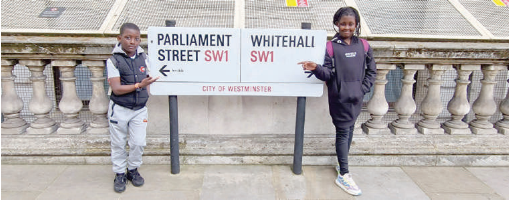
Exploring London, Junior Half Term Holiday Scheme, June 2022

Since 1945 the support the Club has received from the founders, their families, past members, and friends, has made it possible for us to provide an excellent range of services and activities for the children of Hammersmith & Fulham and beyond. In the current cost-of-living crisis, our need for financial support is more pressing than ever.