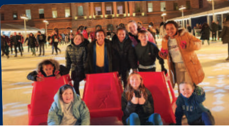
Somerset House Ice Skating, December 2022