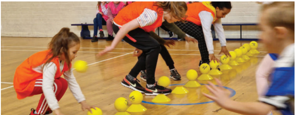
Dodgeball, Junior Easter Holiday Scheme, April 2022