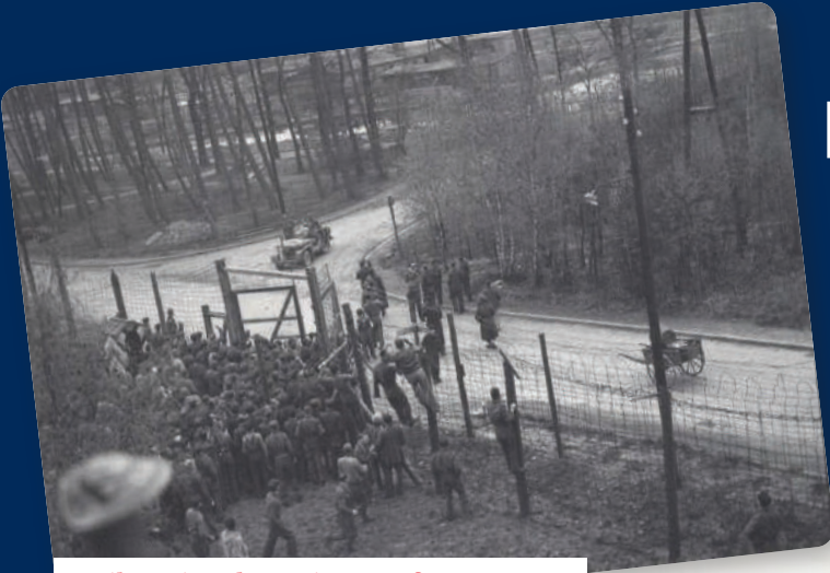
Liberation day, prisoner of war camp Oflag 79, Brunswick, Germany