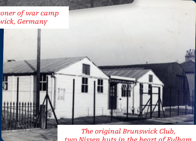
The original Brunswick Club, two Nissen huts in the heart of Fulham