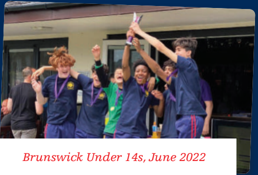
Brunswick Under 14s, June 2022

"I come so I can learn more stuff and play football."