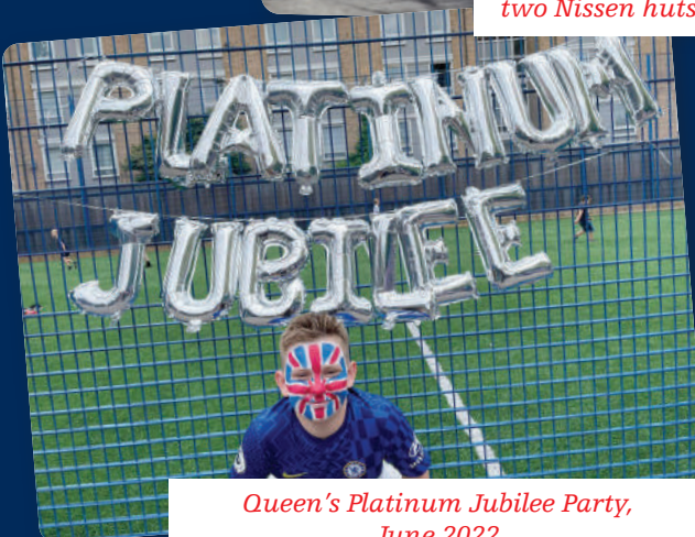
Queen's Platinum Jubilee Party, June 2022